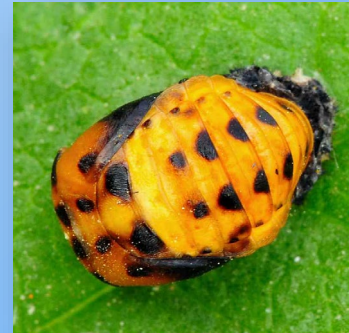
Adults and larvae are proficient aphid eaters