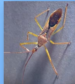
Hide and ambush their prey and eat almost any insect